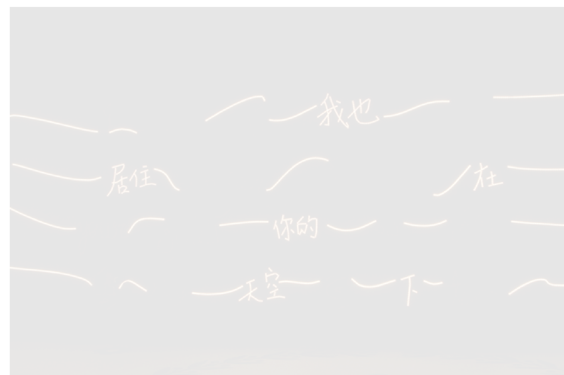
September 23, 2012 Shanghai in Art